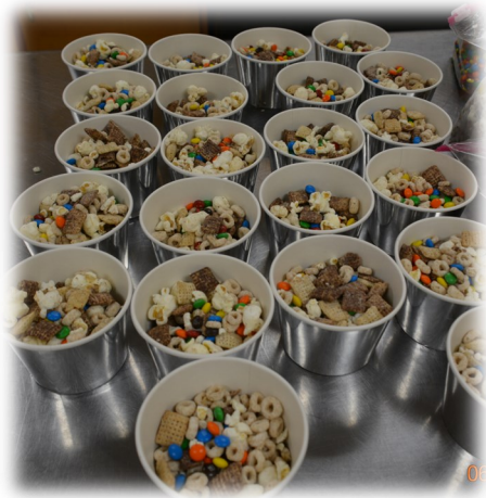
Dog Chow, anyone?