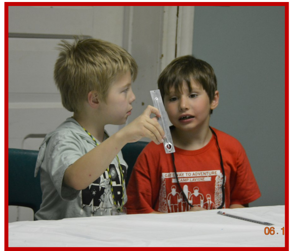
“Check out the temperature!”